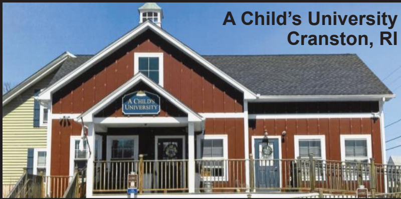
A Child's University Cranston, RI