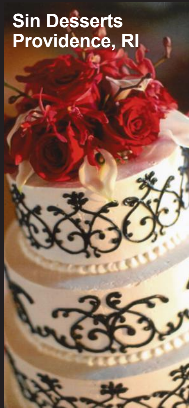
Sin Desserts Providence, RI