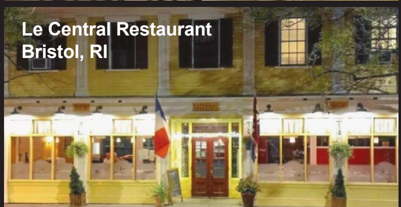
Le Central Restaurant Bristol, RI