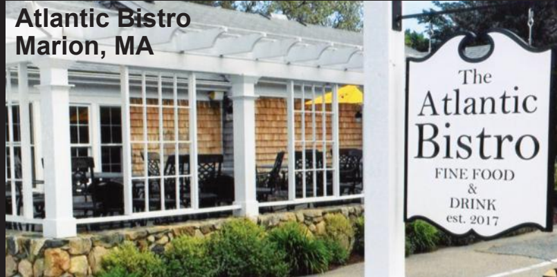
Atlantic Bistro Marion, MA