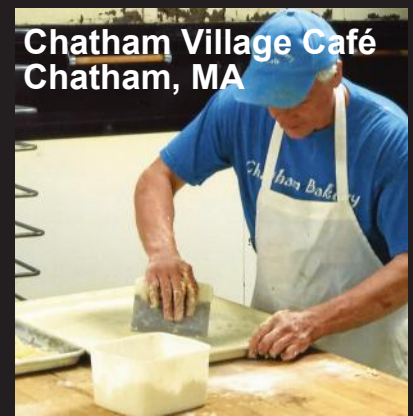
Chatham Village Café Chatham, MA