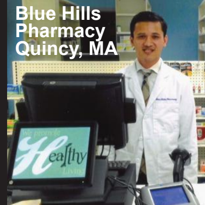
Blue Hills Pharmacy Quincy, MA