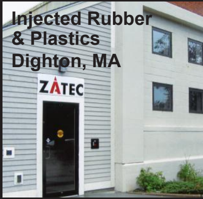
Injected Rubber & Plastics Dighton, MA