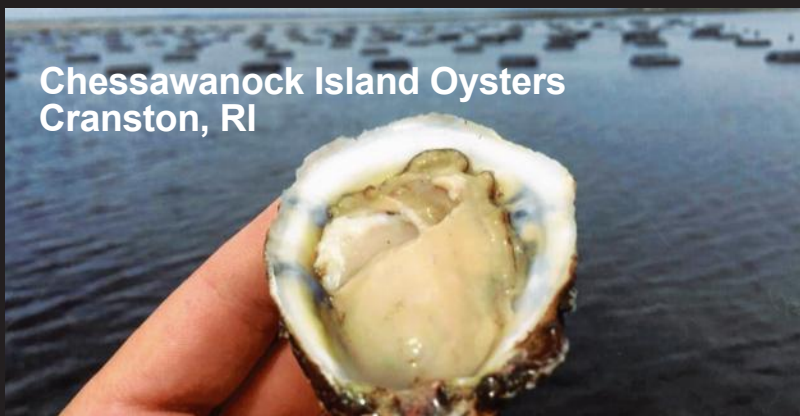
Chessawanock Island Oysters Cranston, RI