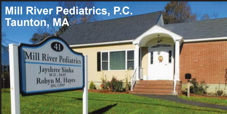
Mill River Pediatrics, P.C. Taunton, MA