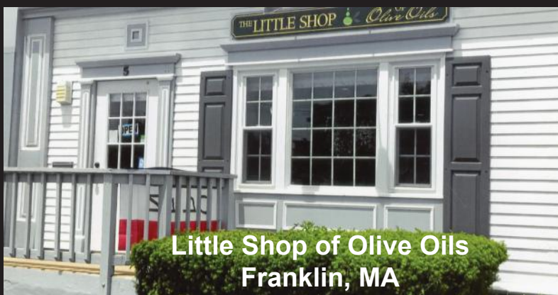
Little Shop of Olive Oils Franklin, MA