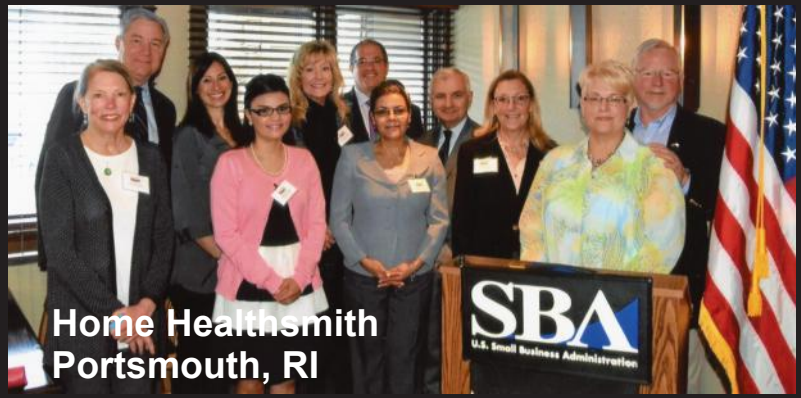
Home Healthsmith Portsmouth, RI