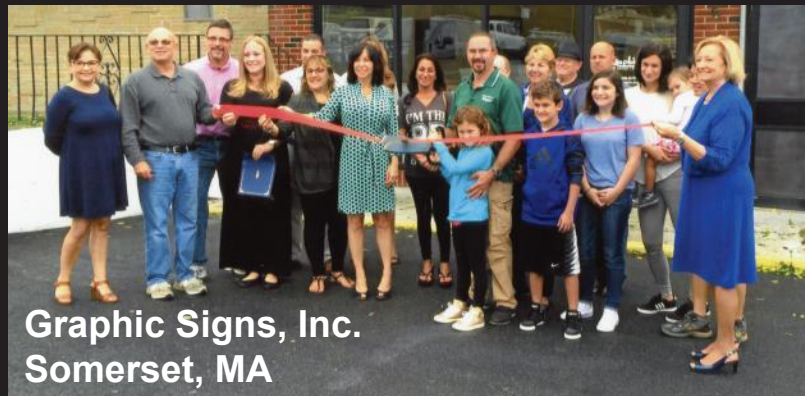
Graphic Signs, Inc. Somerset, MA