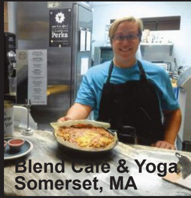
Blend Care & Yoga Somerset, MA